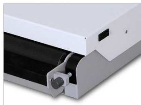
The integrated edge folding unit is adjustable for different cover board thicknesses.