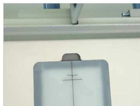
Registration marks for thicker and thinner materials offer you more versatility in applications.