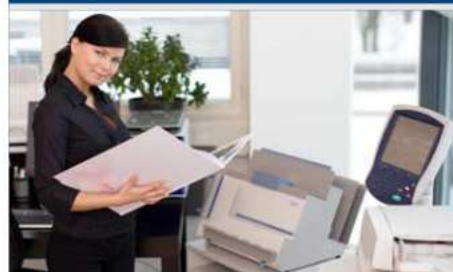
Fastbind BooXter Duo™ can be combined with Fastbind Casematic H46 Pro™ for the best printed hard cover books, photo albums and company presentations.