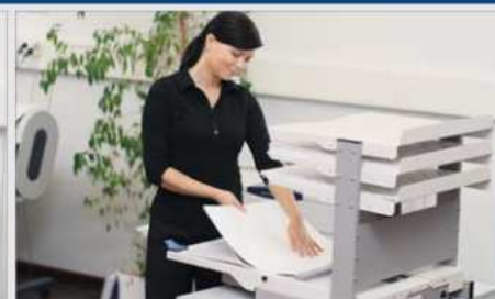
With Fastbind FotoMount F46e™ large format electrical photobook maker you can create a beautiful and professional photobook yourself. The finished book opens astonishing 180 degrees.