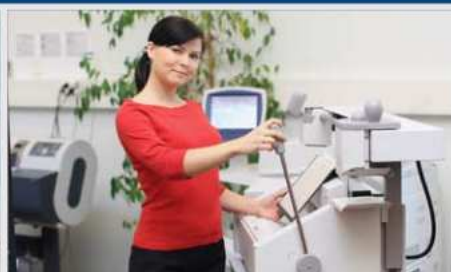
With Fastbind Elite XT™ perfect binding machine anyone can bind professional quality books and reports up to size SRA3 or A4 landscape.