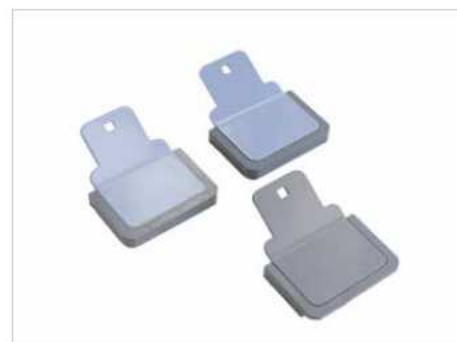
A Cover Guide and two Cover Positioning Holders are included.