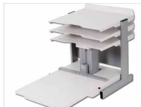
Fastbind FotoMount F46e is a compact, tabletop unit.

Product information as of February 2009 and is subject to change without notice.